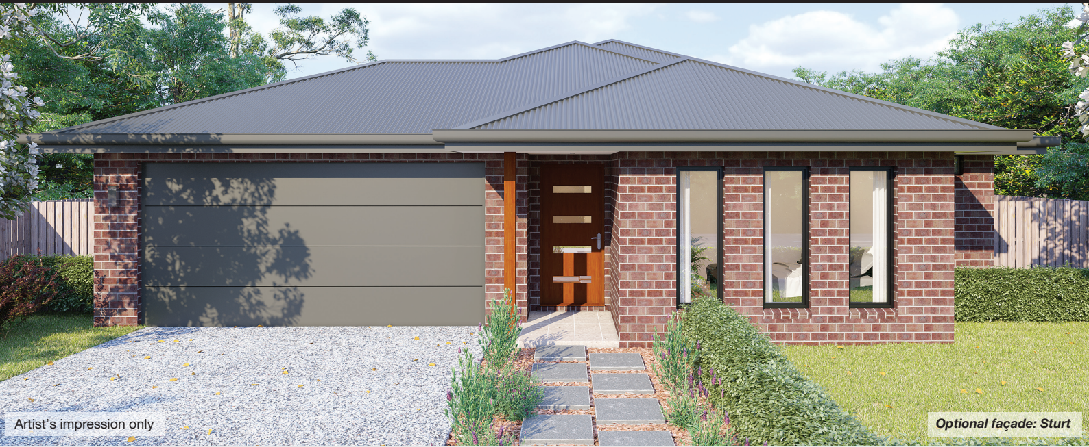
Artist's impression only