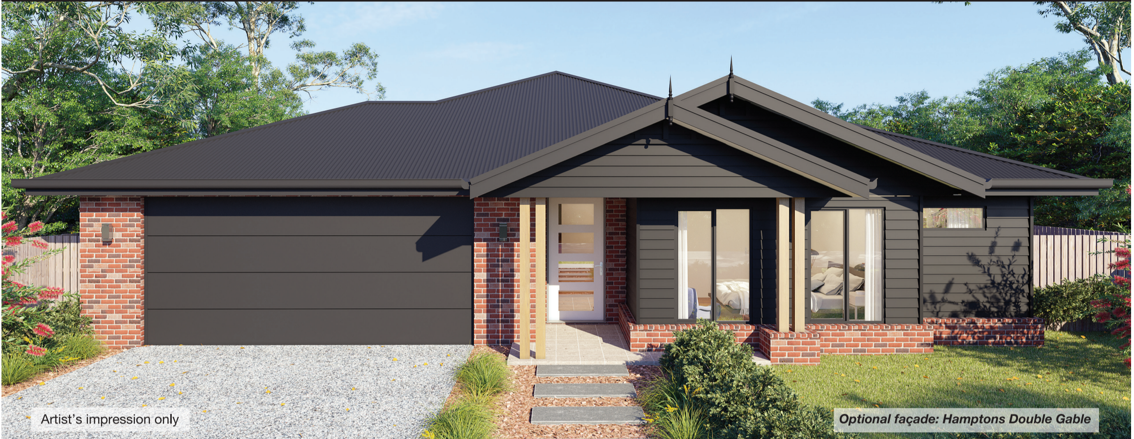
Artist's impression only