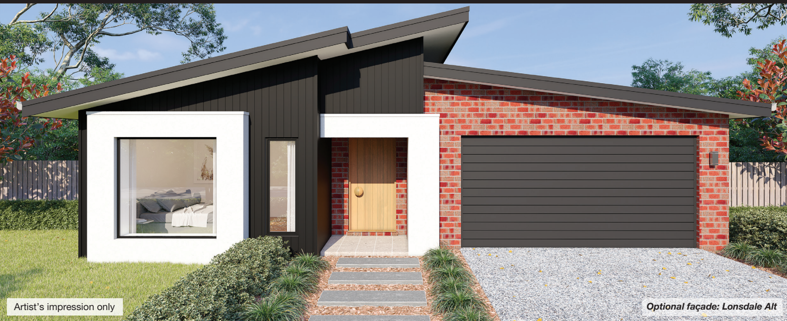
Artist's impression only