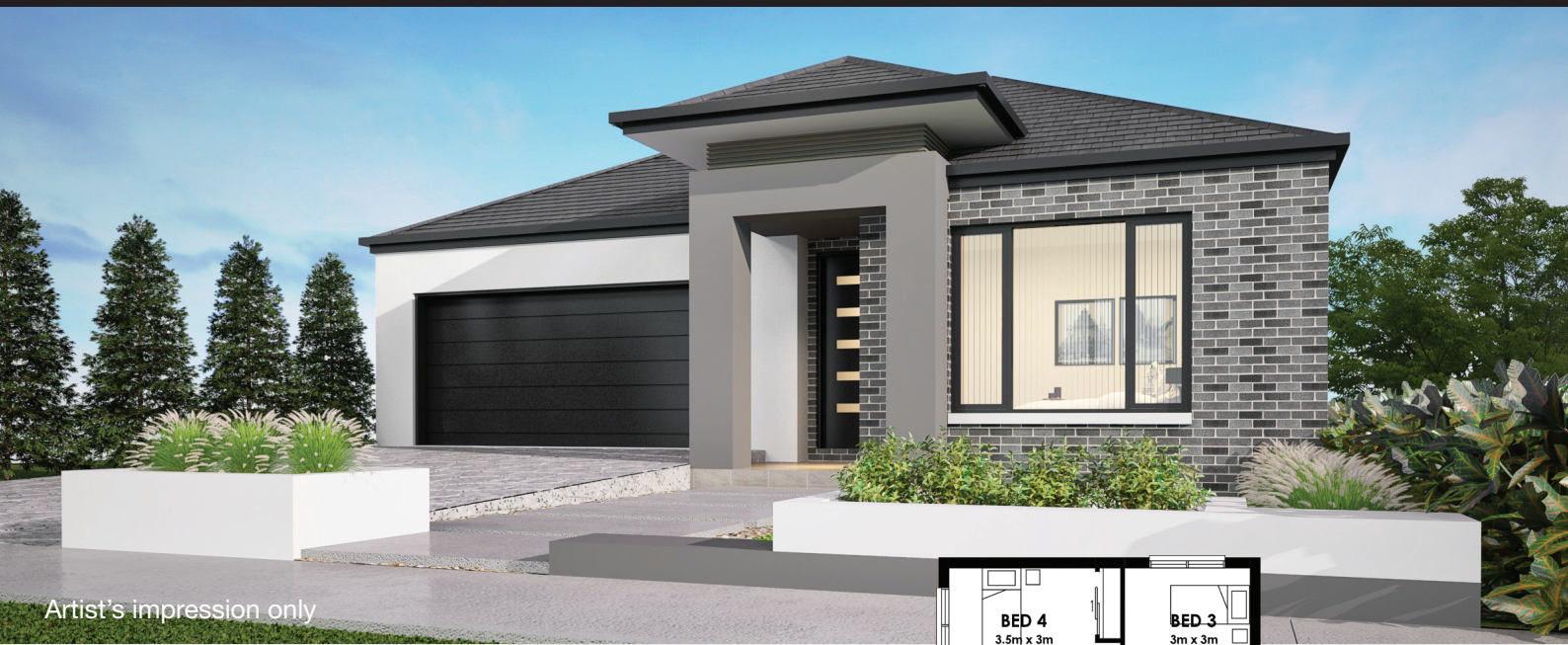
Artist's impression only