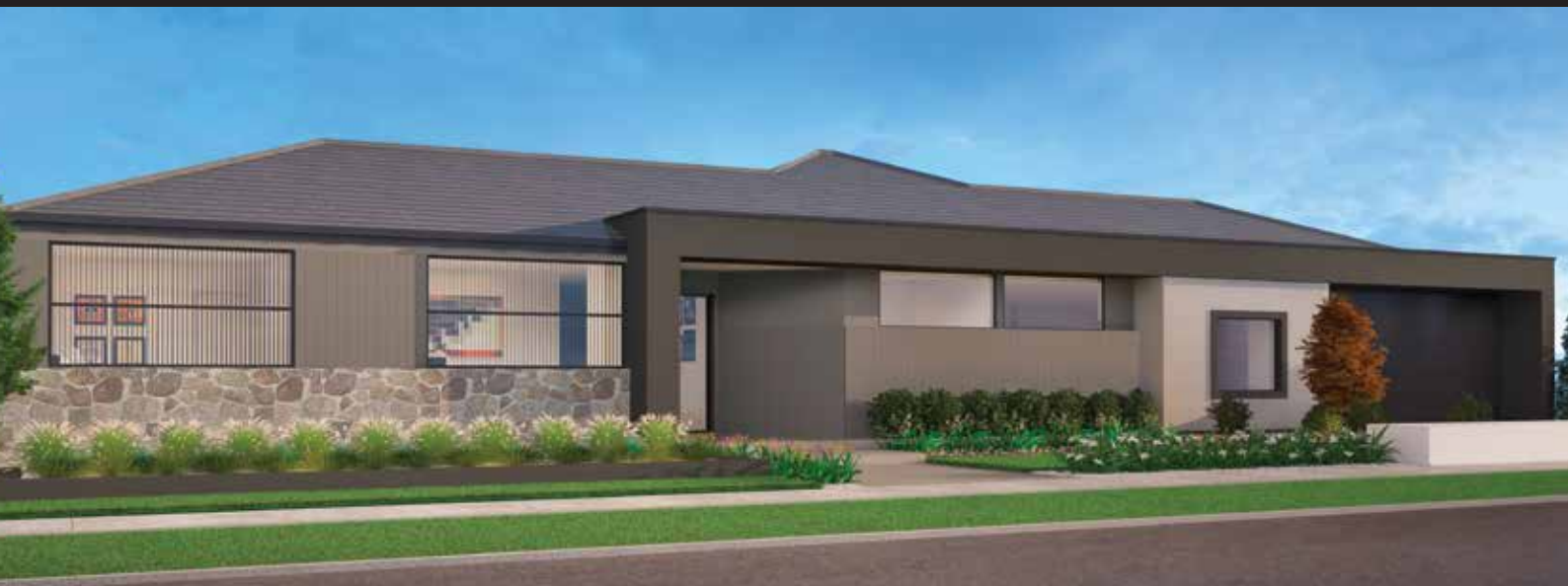
Artist's impression only