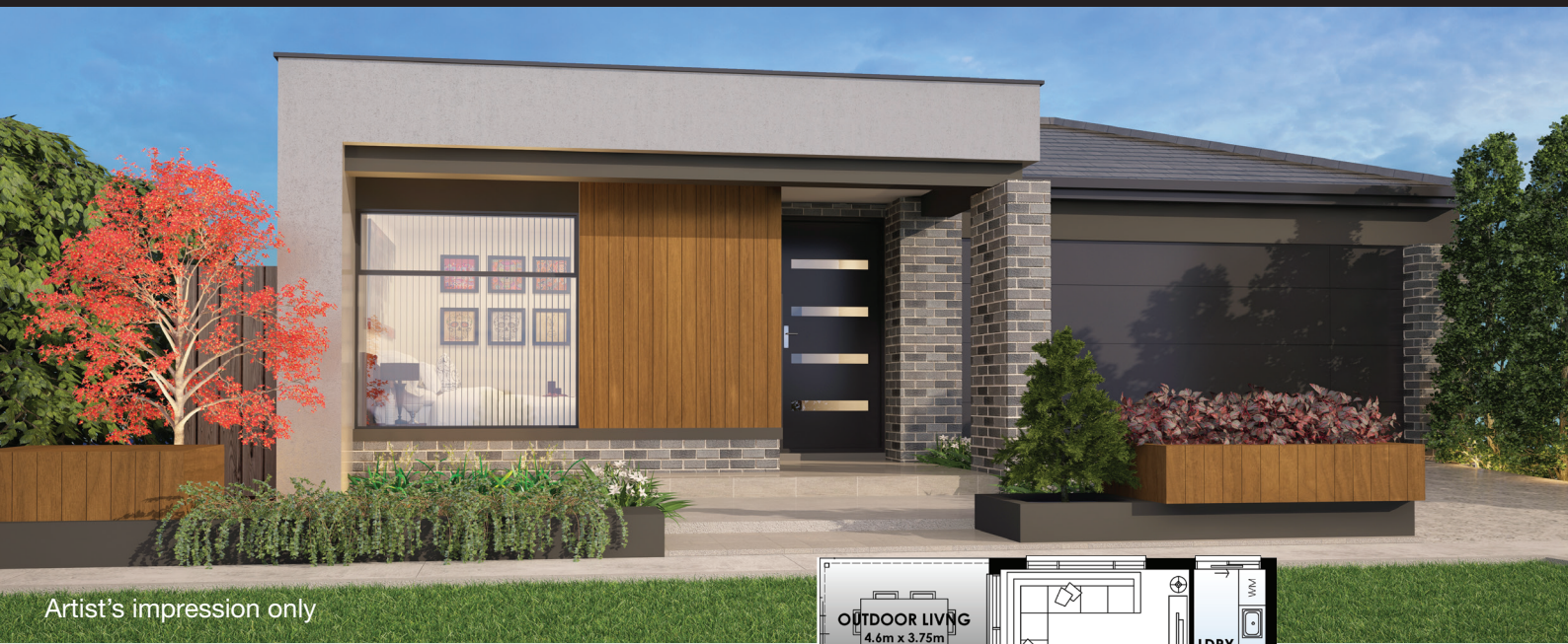
Artist's impression only