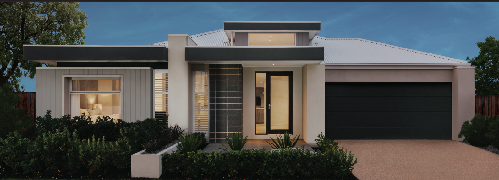
Artist's impression only