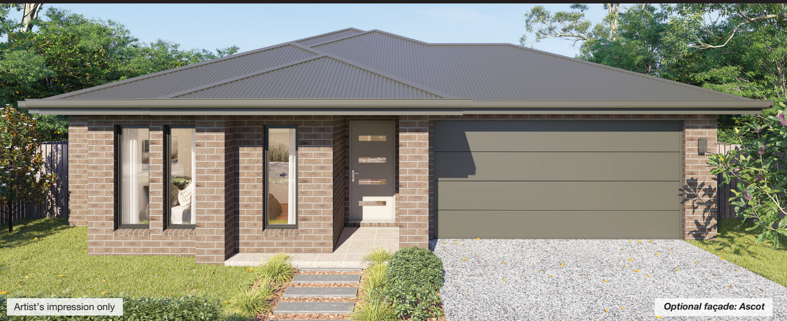
Artist's impression only