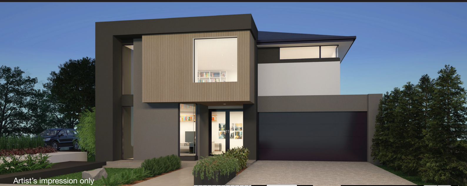
Artist's impression only