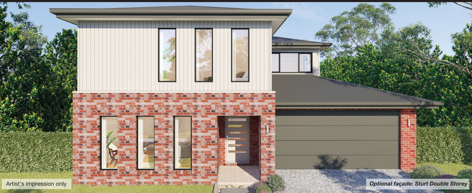
Artist's impression only