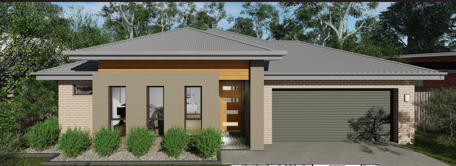
Facade Option: Mokoan